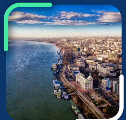
Living Lab 3 Galati, Romania

Living Lab 3 in Galati, Romania will develop an enhanced SFAZ concept tailored to the Romanian context, specifically catering to the inland and Black Sea coastal navigation areas in South-Eastern Romania. This encompasses the waterway system connecting Galati – Tulcea – Sulina – Constanta – Medgidia – Cernavoda – Braila – Galati, as well as the Danube Delta's network of shallow channels. The environmental research vessel REXDAN will play a crucial role in employing data-driven modelling and selective testing of FOREMAST innovations, with a particular emphasis on transferability.