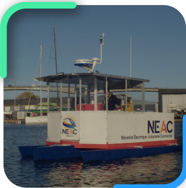
Living Lab 2 Caen, France

Living Lab 2 in Caen, France will create and validate an inventive trimaran vessel design and prototype, aligning with the SFAZ concept. This innovative watercraft is intended for the transportation of goods within urban and intra-urban areas in Caen and Le Havre (Normandy – Natura 2000), using the NEAC platform. While the testing in Caen will take place in a real-life environment, the one in Le Havre will be conducted through simulation.