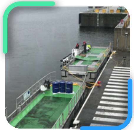
Living Lab 1 Ghent, Belgium

Living Lab 1 in Ghent, Belgium is set to advance and trial an eco-friendly SFAZ vessel solution designed for the urban and intra-urban transport of goods in the Ghent region. This initiative involves retrofitting the currently under-construction AVATAR vessel, customised specifically for urban transport needs, and ensuring its discoverability by logistics players to facilitate new markets for modal shift.